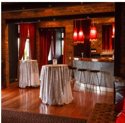
Silver Package POA