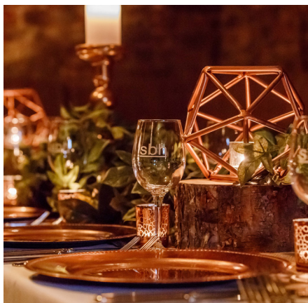
Copper Package POA